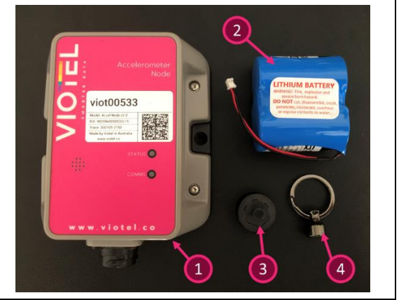
Table 1 Parts List