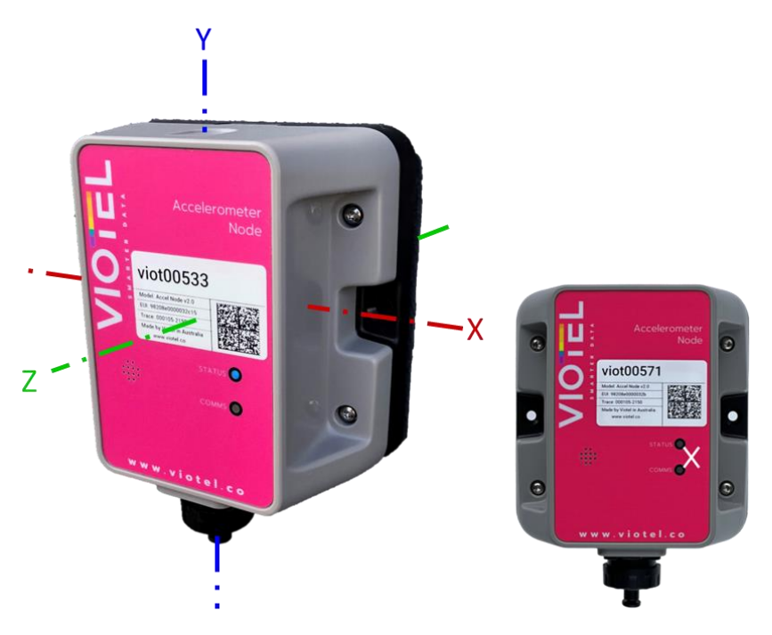
Figure 2 Photo showing X, Y, Z Axis Orientation & Magnet Location

The switch that the magnet (Part 4) operates on the Accelerometer (Part 1) is located between the STATUS LED and the COMMS LED indicated by the 'X'.